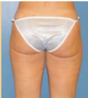
After 3 treatments