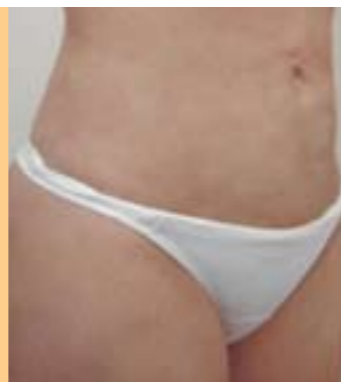
After 4 treatments