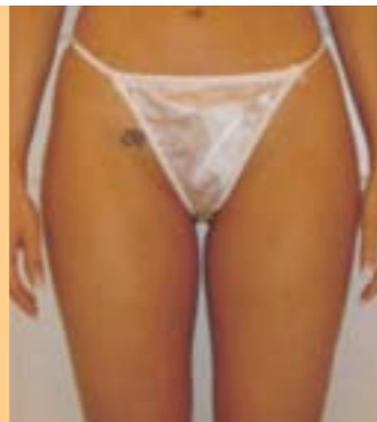
After 6 treatments