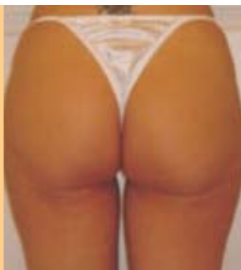
After 6 treatments