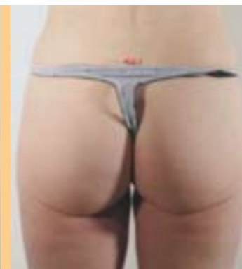
After 3 treatments

"I can't admit to knowing how this works – but I know that it does. The measurements speak for themselves. My clothes fit better and I was aware of a difference from the first treatment."